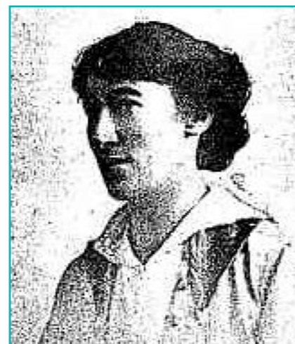
Emma Argyle Cuthbert

AANS 3 rd Australian General Hospital. Head Sister. Awarded Nursing certificate of the Children's Hospital Melbourne in 1903. Enlisted no 1914. Embarked Dec 1914 and was terminated July 1919. Served in Egypt, England and France. Awarded Royal Red Cross 2 nd class for valuable service France and Flanders.