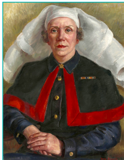
Portrait by Nora Heysen

Commenced training at the Children's Hospital in 1913.